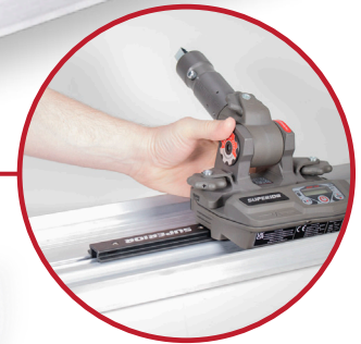
QAS™ Quick Attach System