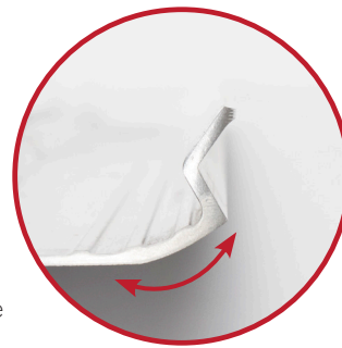
Curved Front Profile